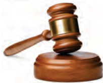
Sandra Day O'Connor