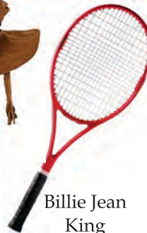
Billie Jean King